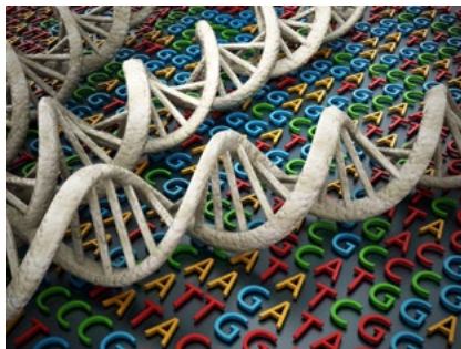
People with HD have an abnormal repetitive CAG repeat in their DNA sequence.

RNA serves as an intermediate between DNA molecules and proteins; the genetic code within DNA is copied into RNA, which is then used as a template for making proteins. The mutant