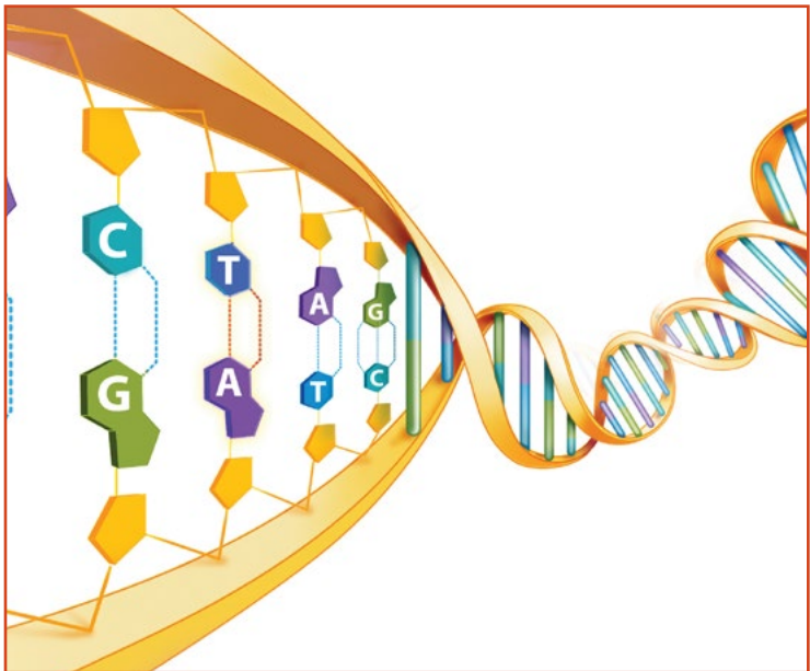
Genes are composed of a long chain-like molecule called DNA. Within a DNA chain are four types of nucleotides abbreviated as A, T, C, and G.