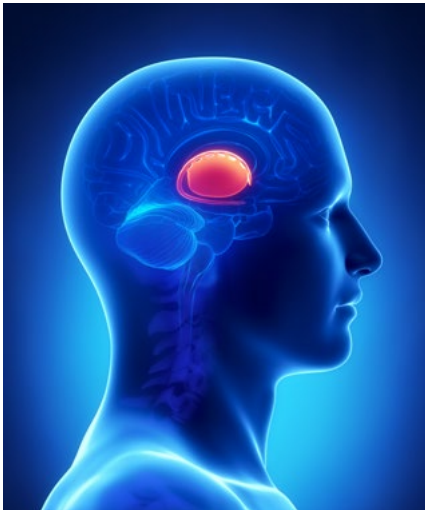
In HD, the most severe loss of neurons occurs in an area of the brain called the basal ganglia.

strongly affected area is the brain's outer surface, or cerebral cortex, which has important roles in movement, as well as thought, perception, memory, and emotion. As HD progresses over time, neuronal degeneration becomes more widespread throughout the brain. In addition to metabolic changes, there is degeneration in areas of the brain that control hormones.