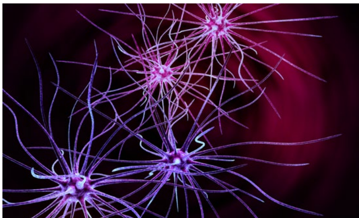
Neurons in an area of the brain called the striatum are most affected by HD.