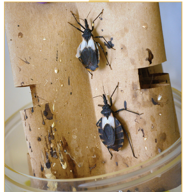
Photo of a triatomine bug which if infected can transmit T. cruzi .