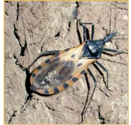
Photo of a triatomine bug which if infected can transmit T. cruzi .

CDC provides extensive support to physicians and patients nationwide, including education about the disease, patient risk factors for infection, diagnostic testing, recommendations for appropriate evaluation and treatment, and the release of medication. Treatment for Chagas disease is available. In the United States; antiparasitic drugs are available only from CDC for use under investigational protocols for compassionate treatment. CDC has released treatment drugs more than 300 times since 1997, 164 times between January 2007 and December 2009. This recent, substantial increase in requests for treatment may reflect growing recognition and increasing frequency of testing for Chagas disease in the United States.