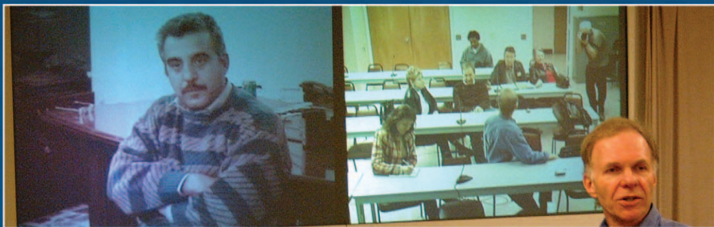
Test of WiRED's Telemedicine System at San Francisco State University's Audio Video Facility, February 2006

Since most Western medical schools have Telemedicine centers, this means that Iraqi and American physicians can collaborate "face to face" on lectures and seminars and on patient diagnosis and treatment. WiRED, Children's National Medical Center, in Washington, D.C. and the University of California, San Francisco Medical School have formed a consortium to provide these educational and consulting services.